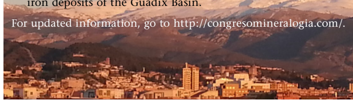
A view of the Sierra Nevada from Granada, Spain

For updated information, go to http://congresomineralogia.com/ .