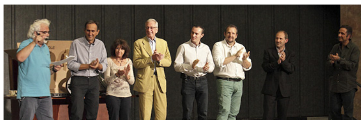
Final bow of the actors in the Geo-Show. Researchers from industry and academia, as well as Italian “anchormen,” participated in the show to the great satisfaction of the public.