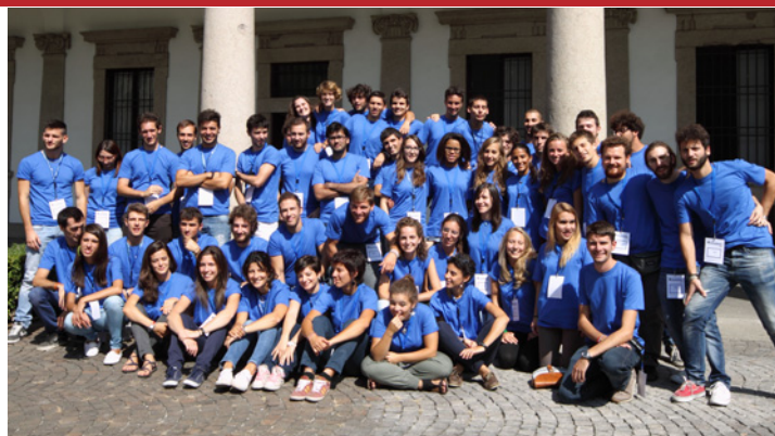
The volunteer “blue boys and girls” helped to make the congress a success.

The SIMP thanks the University of Milan and the Earth Sciences Department “Ardito Desio” for the warm welcome and for the human and economic contribution that ensured the success of the congress. The closing ceremony and Geo-Show in the Aula Magna of the University of Milan was sold out. The next SIMP congress will be held in Florence in September 2015.