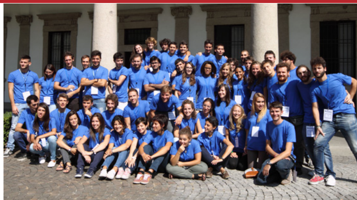
The volunteer “blue boys and girls” helped to make the congress a success.

The SIMP thanks the University of Milan and the Earth Sciences Department “Ardito Desio” for the warm welcome and for the human and economic contribution that ensured the success of the congress. The closing ceremony and Geo-Show in the Aula Magna of the University of Milan was sold out. The next SIMP congress will be held in Florence in September 2015.