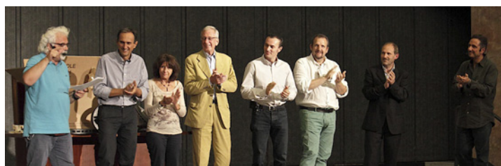
Final bow of the actors in the Geo-Show. Researchers from industry and academia, as well as Italian “anchormen,” participated in the show to the great satisfaction of the public.