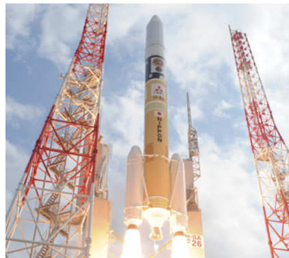
Launch of H-IIA F26 with Hayabusa2 on board.