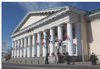
St. Petersburg Mining Institute