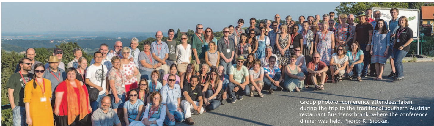
Group photo of conference attendees taken during the trip to the traditional southern Austrian restaurant Buschenschrank, where the conference dinner was held.

As one would expect at a Geoanalysis meeting, social aspects were also a major focus, with every day having something new on offer. In addition to the Sunday ice breaker, the conference also organized a trip to Leoben’s Gösser museum and its adjacent brewery, where participants could witness beverage production on a massive scale (Monday evening), an excellent classical music recital at the university’s Rector’s Auditorium (Tuesday night) and an amazing conference meal held at a country estate that specializes in locally produced products. The many events offered not only excellent opportunities to discuss science but also provided many enjoyable memories of Leoben, resulting in a very successful conference.