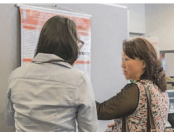
Geoanalysis 2015 provided much time for detailed discussion during the poster sessions, which were a major highlight of the conference.