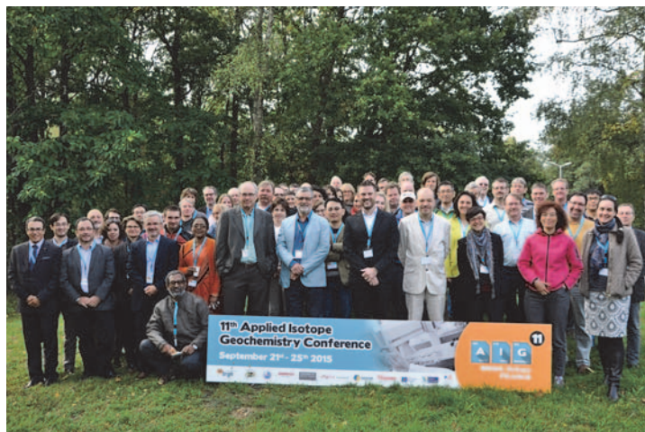
Participants of the 11th Applied Isotope Geochemistry IAGC Working Group meeting in Orléans, France, 21–25 September 2015

I am writing this having just attended the 11 th Conference on Applied Isotope Geochemistry (AIG-11), held 21–25 September 2015 in Orléans (France). This was the latest in a long series of stimulating meetings organised by the working groups of the IAGC that combine high-quality presentations on a variety of topics with ample opportunities for networking and informal discussions. The meeting was splendidly organised by the Bureau de Recherches Géologiques et Minières (BRGM) and was attended by over 90 participants from several countries. I was particularly impressed by the standard of presentations from the research students and postdoctoral fellows, both in terms of content and depth of understanding. A fuller report of AIG-11 will be presented on the IAGC web page in due course, and for those of you who have not attended one of the working group meetings I recommend that you to add it to your to-do lists.