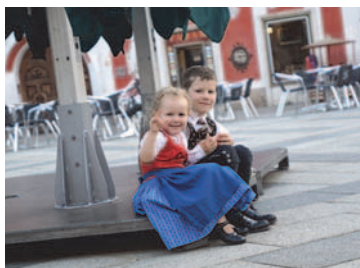
The youngest members of the Sunday evening cultural programme, held on Leoben’s central market square.

Geoanalysis 2015 itself was a resounding success. There were 130 registered participants, thus maintaining the very healthy level of interest seen at the previous two Geoanalysis meetings in Brazil (2012) and South Africa (2009). Sunday (August 9) began with three optional workshops: “Portable XRF Instruments”, “Fundamentals and Applications of LA-ICP-MS” and “The GeoPT Proficiency Testing Programme”. Conference registration was also open for those not attending the workshops. The evening ice-breaker reception went on to set the tone for the remainder of the week: a barbeque on the city’s renaissance/baroque “Marktplatz”, including traditional Austrian dances demonstrated by a local dance troupe.