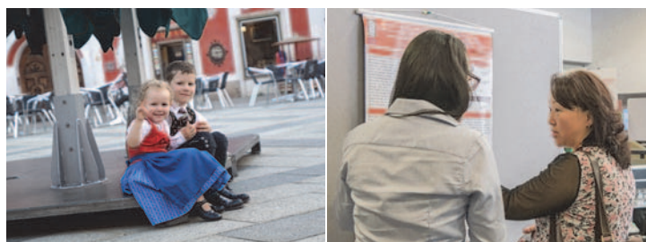
The youngest members of the Sunday evening cultural programme, held on Leoben’s central market square.

Geoanalysis 2015 itself was a resounding success. There were 130 registered participants, thus maintaining the very healthy level of interest seen at the previous two Geoanalysis meetings in Brazil (2012) and South Africa (2009). Sunday (August 9) began with three optional workshops: “Portable XRF Instruments”, “Fundamentals and Applications of LA-ICP-MS” and “The GeoPT Proficiency Testing Programme”. Conference registration was also open for those not attending the workshops. The evening ice-breaker reception went on to set the tone for the remainder of the week: a barbeque on the city’s renaissance/baroque “Marktplatz”, including traditional Austrian dances demonstrated by a local dance troupe.