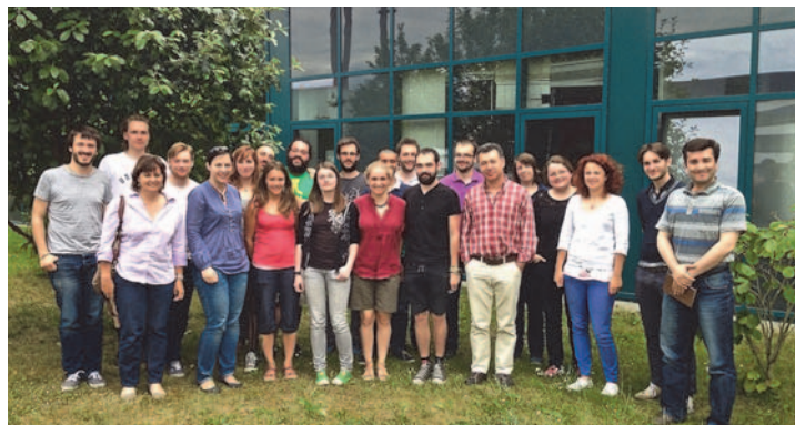
Group photo of the PETROCHRO2015 Workshop