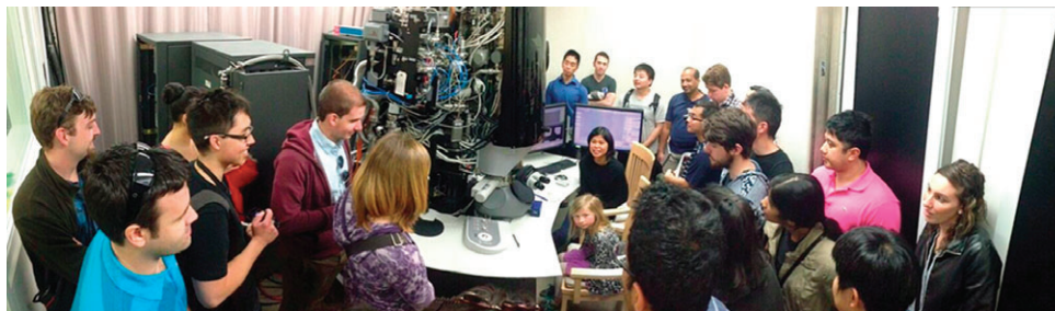
A group of students are introduced to a high-resolution transmission electron microscope (HRTEM; this one is an FEI Titan) at Stanford's NNCI site, nano@Stanford (nanolabs.stanford.edu). Cutting-edge TEMs are vital for characterizing the composition and atomic structure of complex and important Earth nanomaterials.

The potential for discovery and innovation within the Earth sciences using nanoscience and technology is enormous. These centers are available to assist users, from the novice to the most experienced, in these pursuits. Users working at the local, regional, and global scales—including land, atmospheric, water, and biological components of any subfield within the Earth and environmental sciences and engineering—are welcome to get involved. Users will enhance their ability to apply nanoscience and nanotechnology to help solve challenges in far-reaching and critical issues in all of the Earth sciences, including climate change, critical zone research, chemical oceanography, hydrology, ore deposits, paleoecology, paleontology, fault mechanics, fundamental aspects of mineralogy, geochemistry, petrology, geophysics research, medical mineralogy and geochemistry, and more. Nanoscience and technology goes far beyond analyzing targets at the nanoscale. It is also important to understand how chemical and physical behaviors change from the bulk to