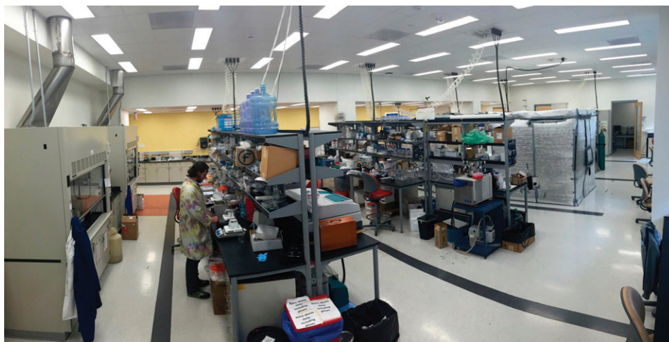
A portion of the infrastructure at Virginia Tech's National Center for Earth and Environmental Nanotechnology Infrastructure ( www.nce2ni.ictas.vt.edu ). In this laboratory, users can synthesize nanomaterials that are important in Earth processes in order to study them more thoroughly.

the nanoscale. Understanding these differences can be used to understand (in terms of the science) and to innovate (in terms of the technology) processes that can be applied to any aspect of the Earth and environmental sciences.