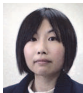
2015 GEOCHEMICAL JOURNAL AWARD: Minako Hashiguchi (Japan Aerospace Exploration Agency)