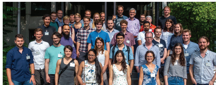
Participants at the DMG's 2018 Petrology/Geochemistry meeting in Göttingen (Germany).

The annual joint meeting of the Geochemistry and Petrology/Petrophysics sections of the German Mineralogical Society (DMG) took place 9–10 July at the Geosciences Centre of the University of Göttingen (Germany). Approximately 40 geoscientists from 11 research institutes across Germany and Austria attended the meeting. Many of the participants were PhD students and postdocs. The oral and poster presentations spanned an enjoyably diverse range of topics, from cosmochemistry, experimental petrology and volcanology, to low-temperature isotope geology and methodological developments in mass spectrometry and radiometric dating methods. After an inspiring oral program (13 talks) and an equally inspiring poster session (12 presentations), the canonical barbecue of the meeting took place on the north campus of the university. This excellent barbecue was organized by the geosciences study association of the University of Göttingen, who made provision for both the carnivorous and the vegetarian/vegan options. The poster session and barbecue alternated with several possible tours for the participants. The first was a visit to two new exhibitions at the university's Mineralogical Museum: one on minerals, and one specifically on amber. The second was to various demonstrations at the laboratories of the mineralogy and isotope geology departments. We are greatly looking forward to an equally exciting meeting in Heidelberg in 2019!