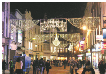
A festive Grafton Street in Dublin's city centre.