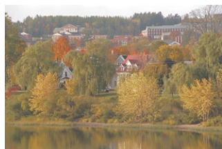
The University of New Brunswick, where the meeting will be held, was the first public university established in North America.

(AAG). It is also co-sponsored by the International Association of Geochemistry (IAGC) and the International Association of Geoanalysts (IAG), and will include the North Atlantic Minerals Symposium (NAMS). IAGS 2009 is jointly organized by geoscientists from the University of New Brunswick (UNB), the New Brunswick Department of Natural Resources, the New Brunswick Research and Productivity Council, and the New Brunswick Department of the Environment, and by professionals drawn from the consulting engineering and mineral exploration industry in New Brunswick.