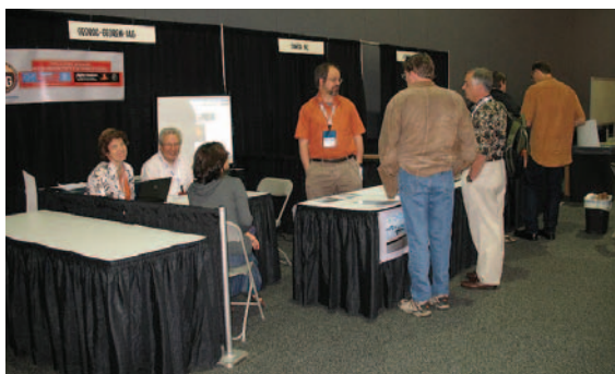
For five days a steady flow of delegates visited the GEOROC-GeoReM-IAG information booth in the Goldschmidt exhibition hall.

Enlarging further the IAG's activities at the Goldschmidt Conference, the IAG joined up with GEOROC and GeoReM this year in sponsoring an information booth located in the main exhibit hall where the poster sessions were held. This new initiative was a certain success as around 100 delegates expressed an interest in the activities of these three organizations. IAG's new partnership with these two database operators, both with years of experience in showcasing their services at international meetings, is a natural one. Both GEOROC and GeoReM provide the user community with easy access to large volumes of high-quality geochemical data, whereas one of the IAG's core missions is to give analytical geochemists the means to assure that their data quality is fit for the required purpose.