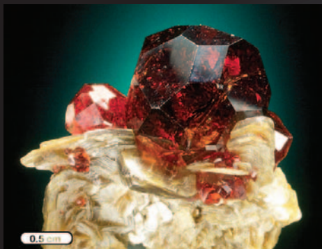
Spessartine on Muscovite: Shengus, Haramosh Mts, Baltistan, Northern Areas, Pakistan. Image from The Photographic Guide to Mineral Species CD, available exclusively from Excalibur Mineral Corporation. PHOTO BY JEFF SCOVIL

FROM our inventory of over 200,000 specimens, we can supply your research specimen needs with reliably identified samples from worldwide localities, drawing on old, historic pieces as well as recently discovered exotic species. We and our predecessor companies have been serving the research and museum communities since 1950. Inquiries by email recommended.