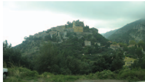
Eze, iconic perched village in southern France

exposure to light and the uncontrolled environmental conditions that inevitably accompany public display are potentially harmful.