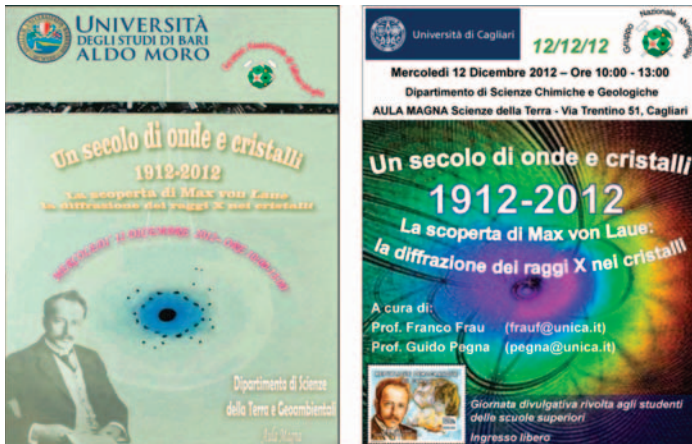
Two examples of posters advertising Laue Day

Near the end of 2012, the informal Italian group Gruppo Nazionale di Mineralogia (GNM) promoted an event aimed at celebrating the centennial of Max von Laue's discovery of X-ray diffraction in crystals. The event was called Giornata Laue ("Laue Day") and was planned to be held simultaneously in a variety of universities all over Italy and to be open to high school students. The event was devoted to the scientific explanation of the principles and application of X-ray diffraction, with emphasis on the importance of crystallography and its impact on society. The selected day was December 12, 2012 (12/12/12).