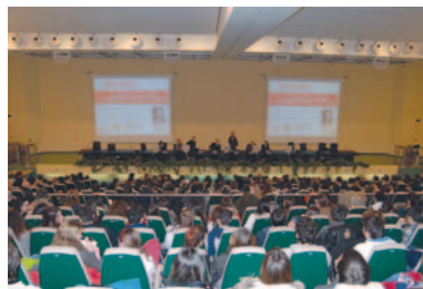
Introducing Laue Day before a large audience at the University of Parma

Ten universities participated in the initiative: the universities of Bari, Cagliari, Genova, Modena, Napoli, Parma, Perugia, Pisa, Roma La Sapienza, and Torino. In most cases, the GNM PowerPoint presentation was followed by guided visits to museums of mineralogy and laboratories of crystallography, where available. In museums, educational itineraries with posters, exhibitions of old X-ray instrumentation, optical benches, ripple generators, etc., helped the students to familiarize themselves with the phenomenon of "diffraction," whereas in crystallography laboratories, modern X-ray instrumentation was shown and experiments were carried out. In other cases, Laue Day was organized as a one-day workshop, with a cycle of seminars in the morning and practical activities in the afternoon.