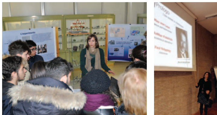
(LEFT) Students visiting the mineralogical section of the Earth science museum at the University of Bari. (RIGHT) Presentation of the lecture "1912–2012: A century of waves and crystals" at the University of Perugia