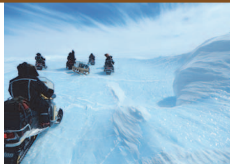
Leaving base camp to search for meteorites

This period of the year corresponds to summer in Antarctica. But as you can probably imagine, temperatures are far from summery: at the Belgian research station (Princess Elisabeth Antarctica research station), located at an altitude of 1400 m, we experienced a range from -10^{\circ}\text{C} to +1^{\circ}\text{C} , when the weather was sunny and without wind. However, the Nansen Blue Ice Field, where we conducted our search and established our base camp, is at an altitude of 2900 m, and the temperatures were far less pleasant. We observed absolute temperatures during the day between -14^{\circ}\text{C} and -27^{\circ}\text{C} , without counting the wind chill. With winds up to 20 m/s, the temperature felt closer to -48^{\circ}\text{C} . January was still the best month for us, as we were able to work every other day. Sometimes we could