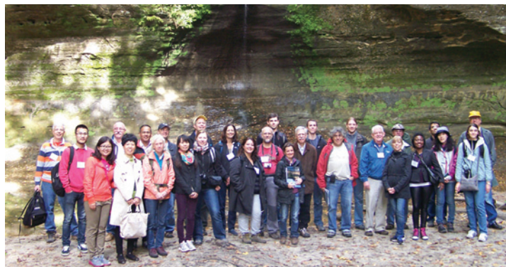
Field trip participants

50 th Clay Minerals Society Annual Meeting at the University of Illinois, Urbana-Champaign, 5–10 October 2013