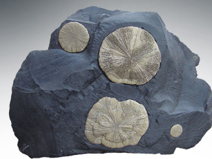
COVER IMAGE: Pyrite (FeS 2 ) in a black shale. The sample is ~30 cm wide and was excavated from a coal mine in Sparta, Illinois (USA).

An International Magazine of Mineralogy, Geochemistry, and Petrology