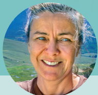
JILL BANFIELD United States of America