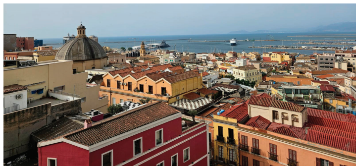
A view of Cagliari.

This year, the Goldschmidt Conference is in Chicago, Illinois, USA from August 18–23. It is organized by the Geochemical Society and the European Association of Geochemistry. For more information, go to https://conf.goldschmidt.info/goldschmidt/2024/meetingapp.cgi .