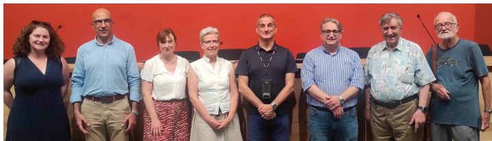
Members of the conference organization committee touring the conference venue.

The 3 rd IAGC International Conference will be held in Cagliari, Italy on June 16–21, 2025. This meeting will include the 18 th Water-Rock Interaction Working Group Meeting (WRI-18), the 15 th Applied Isotope Geochemistry Working Group Meeting (AIG-15), Urban Geochemistry sessions, and a 20 th anniversary celebration of Elements Magazine . Visit https://sites.unica.it/wri-18/ to learn more!