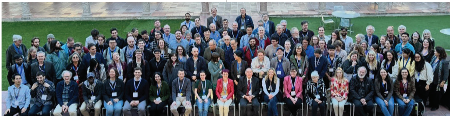
Group photograph of MSA's Inaugural Annual Meeting Attendees at the Historic Pima County Courthouse's Courtyard