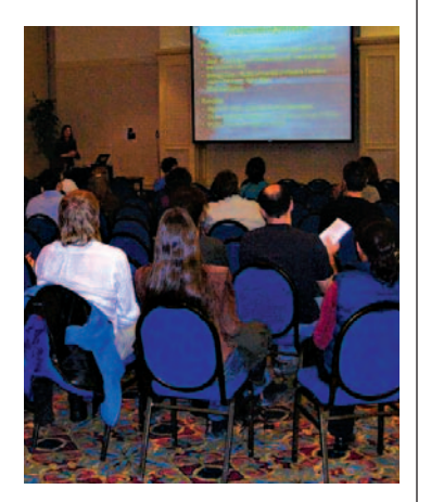
Sylvie Tissandier, Biology/Redpath Museum, McGill University, presenting "Morphological Changes in the Pectoral Fins of Ray-Finned Fish" on 17 March 2006

The objectives of the symposium were for students to (1) communicate their research across disciplines, (2) enrich their own research by exchanging ideas with researchers from different scientific backgrounds, (3) give and receive valuable feedback on presentation formats, and (4) develop skills to network with other researchers and industry