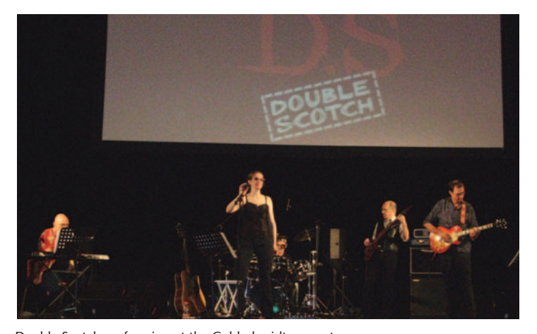
Double Scotch performing at the Goldschmidt concert