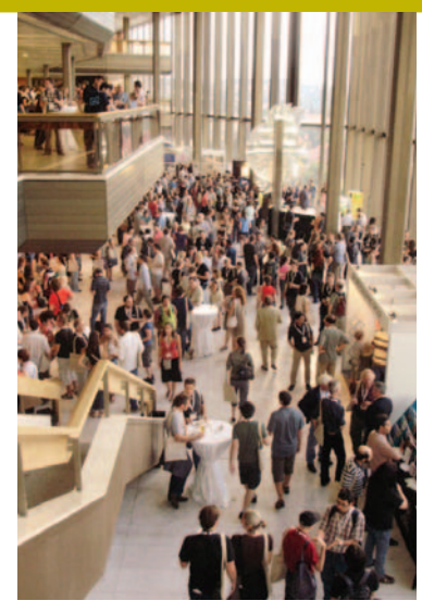
A well-attended ice-breaker party.