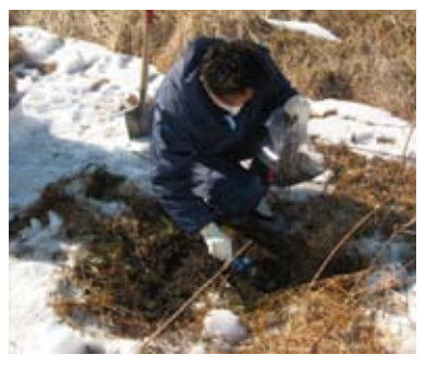
FIGURE 3 Satoshi Utsunomiya sampling soil in a rice field in litate village within the deliberate evacuation area. The snow covering the field decreased the dose to some extent.

The scientific challenges at Fukushima include the very low concentrations of radionuclides that must be detected (e.g. even 160,000 Bq/kg of ^{137} Cs is only equivalent to ~50 parts per trillion), the characterization of the phases associated with each radionuclide, the heterogeneous size distribution of these phases in soils, the large area of contaminated land, and the wide variety of vegetation.