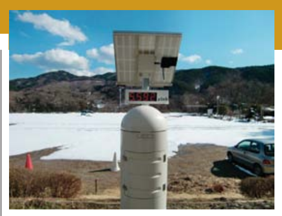
FIGURE 2 A dosimeter stands in the playground of the Tsushima elementary school in Namie town within the deliberate evacuation area. The few parked cars are the property of refugees. People were first evacuated to this elementary school located outside the restricted area; however, they were forced to evacuate again, after the town was included in the deliberate evacuation area.

Within the restricted area, especially within 3 km of the power plant, the radiation dose increases dramatically. After a few hours of field work in Ohkuma (Fig. 3), the dosimeters on our chests read >90 \mu Sv, which is about one-tenth of the annual dose limit for public exposure, 1 mSv/y, recommended by the International Commission on Radiological Protection. During our field work, the dose rate about 3 km south of the plant was as high as 60 \mu Sv/h at 1 m above the ground. The highest dose rate measured was 630 \mu Sv/h beneath a rainwater pipe at point 1 in Figure 1. Such spotty occurrences of high radioactivity have been recognized at many contaminated sites, but they do not appear on the large-scale maps of contamination.